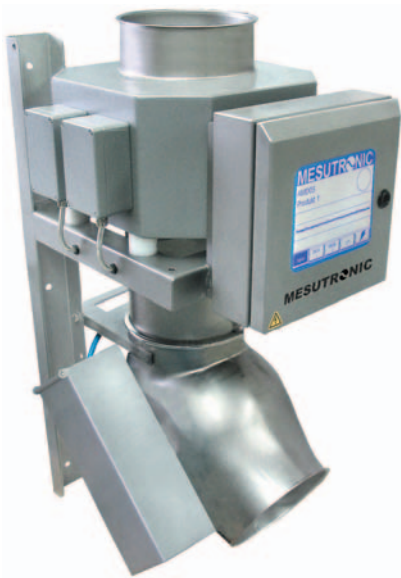
QUICKTRON 05R TOUCH

High frequency Metal Separator for the examination of free flowing bulk materials in free fall. Fully automatic detection and rejection of metallic contaminants from the product stream without process interruption.